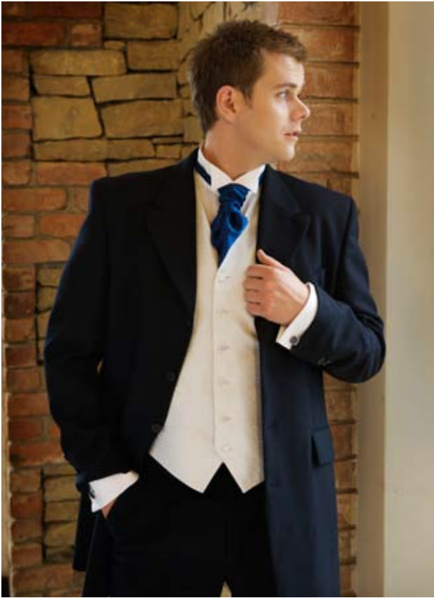
Navy Prince Edward Jacket with matching trousers. Silver/white waistcoat worn over a double cuff wing collar shirt. Navy Blue Scrunchie.

We offer a large collection of waistcoats in various colours with ties and scrunchie's to match.